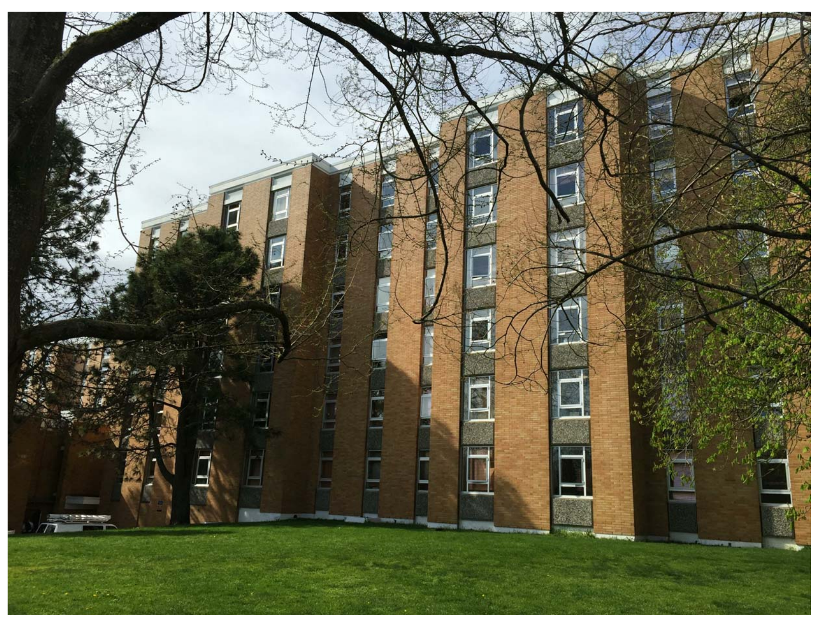
Looking northwest at Haida House