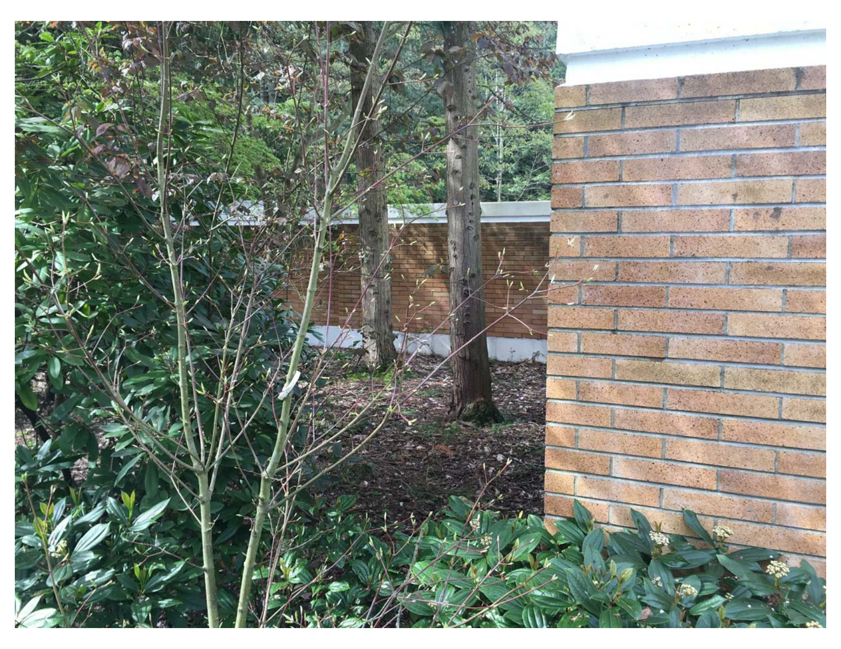
Totem Park landscape

Copyright reserved. This design and drawing is the exclusive property of WMW Public Architecture and Communication Inc. and cannot be used for any purpose without the written consent of the Architect. This drawing is not to be used for construction until issued for that purpose by the Architect. Prior to commencement of the Work the Contractor shall verify all dimensions, datums and levels to identify any errors and omissions; ascertain any discrepancies between this drawing and the full Contract Documents; and, bring these items to the attention of the Architect for clarification. ISSUES + REVISIONS NO DATE DESCRIPTION