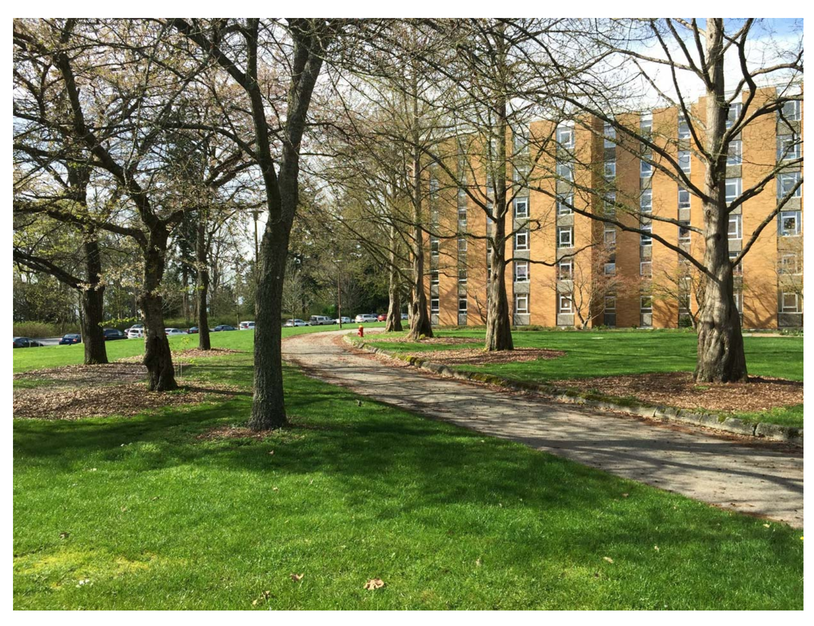
Looking west along existing fire access road

Looking north along Lower Mall pedestrian connection