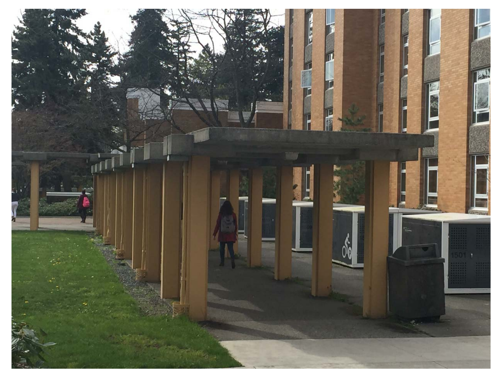
Totem Park rain protection network