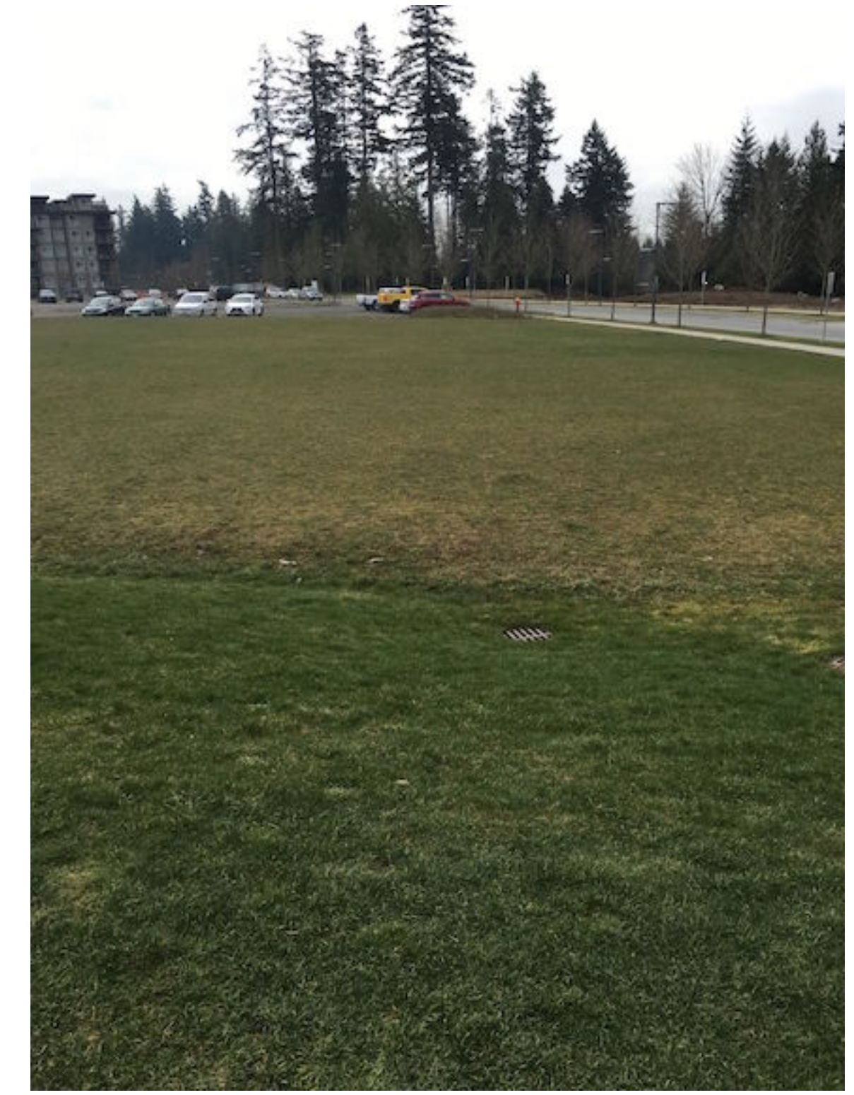
7. View South along West Edge of Site