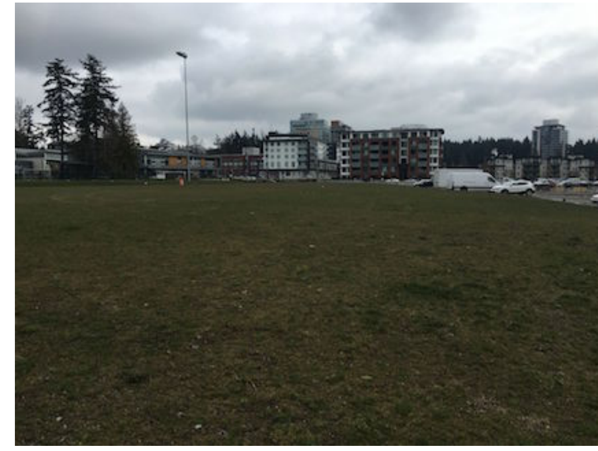
2. View East Across Site