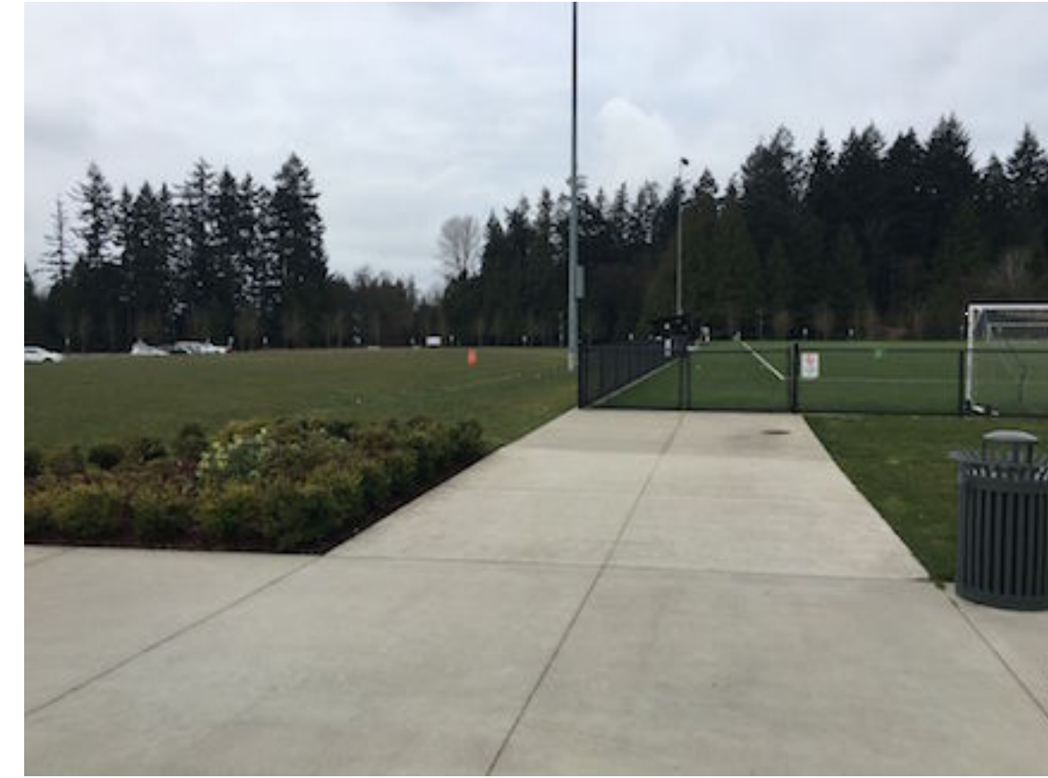
4. View West from Park onto Community Field