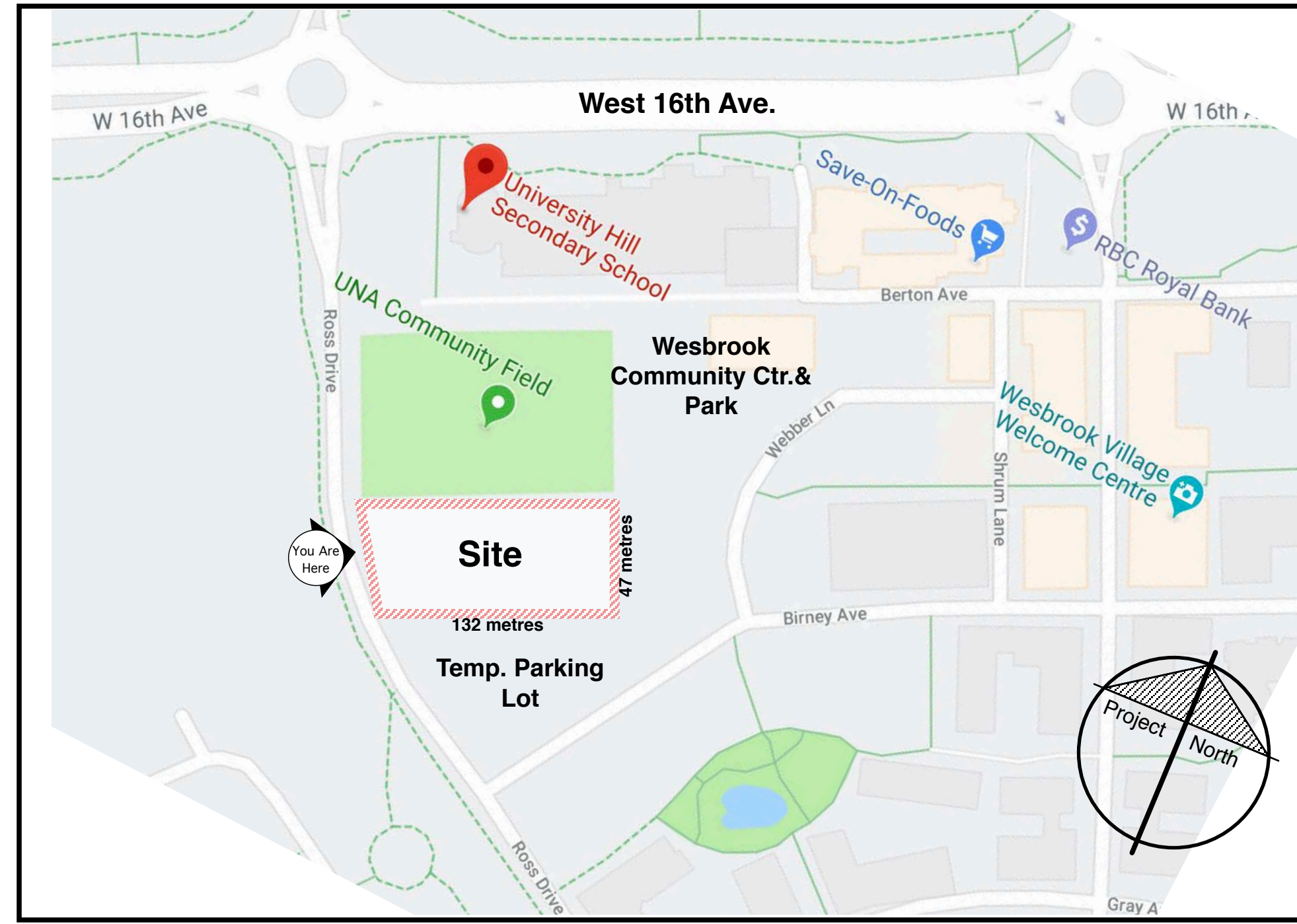
Site Context-South Campus