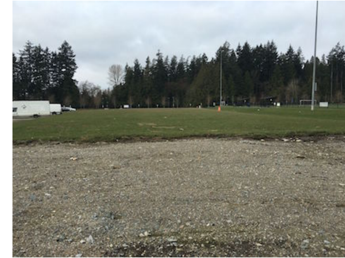
6. View West across Site