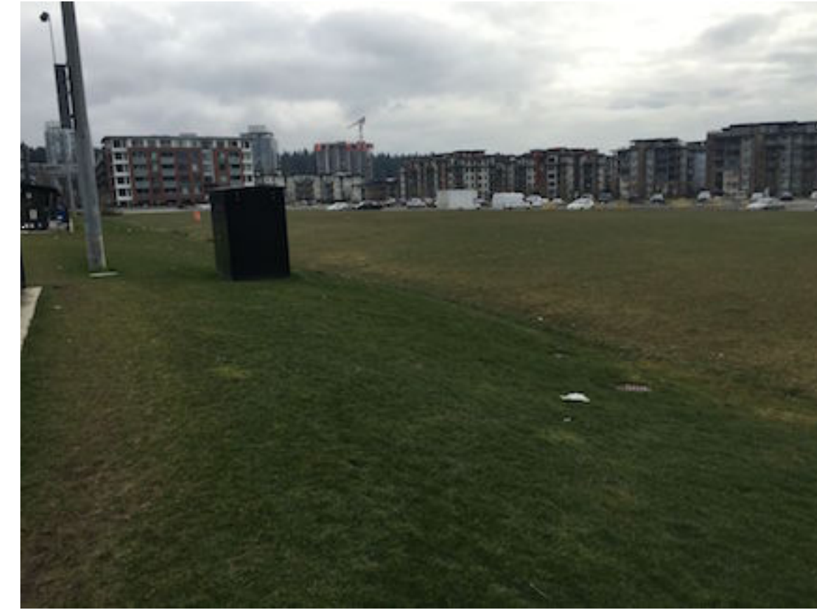
5. View South East across West End of Site