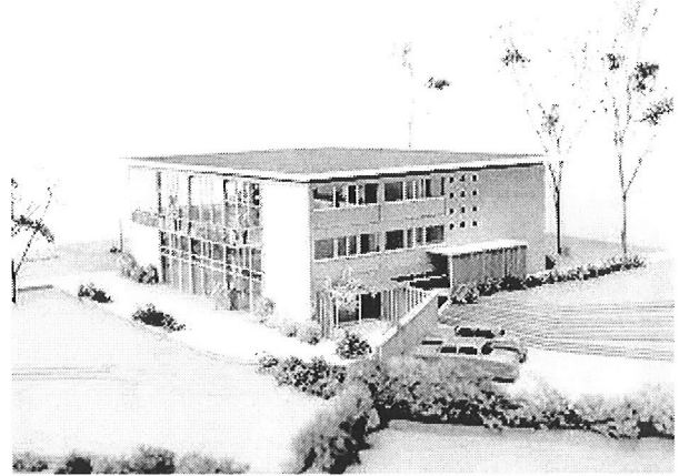
From top to bottom: Design model from two angles Lassore drawing, site plan Opening ceremonies with Eleanor Roosevelt and UBC President MacKenzie North facade in the 1970s