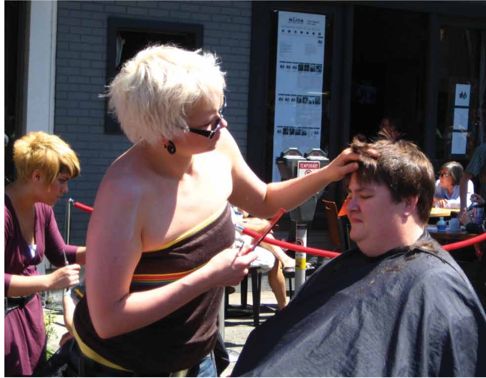
Pop Up Hair Salon