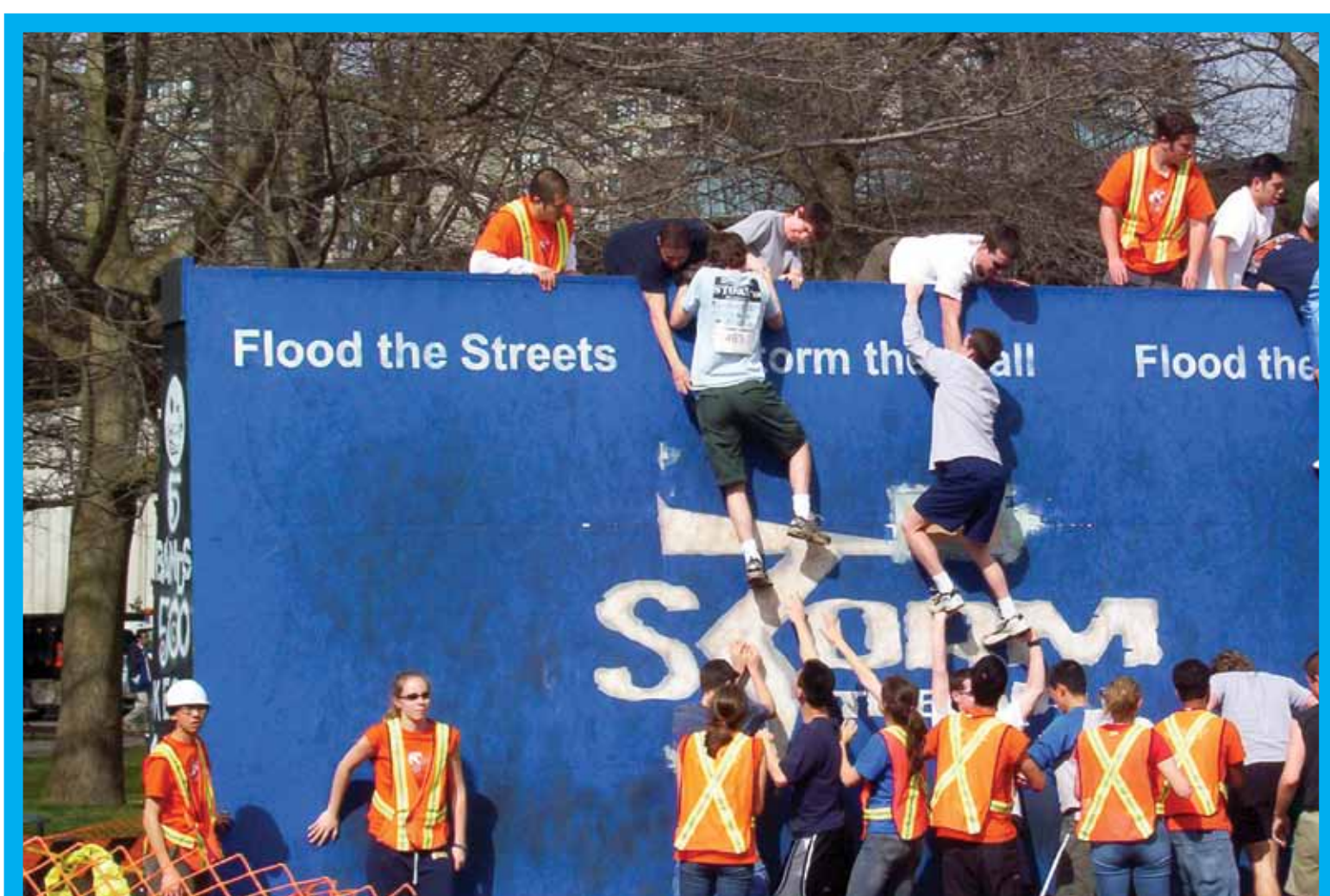
Storm the Wall