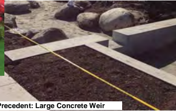
Precedent: Large Concrete Weir