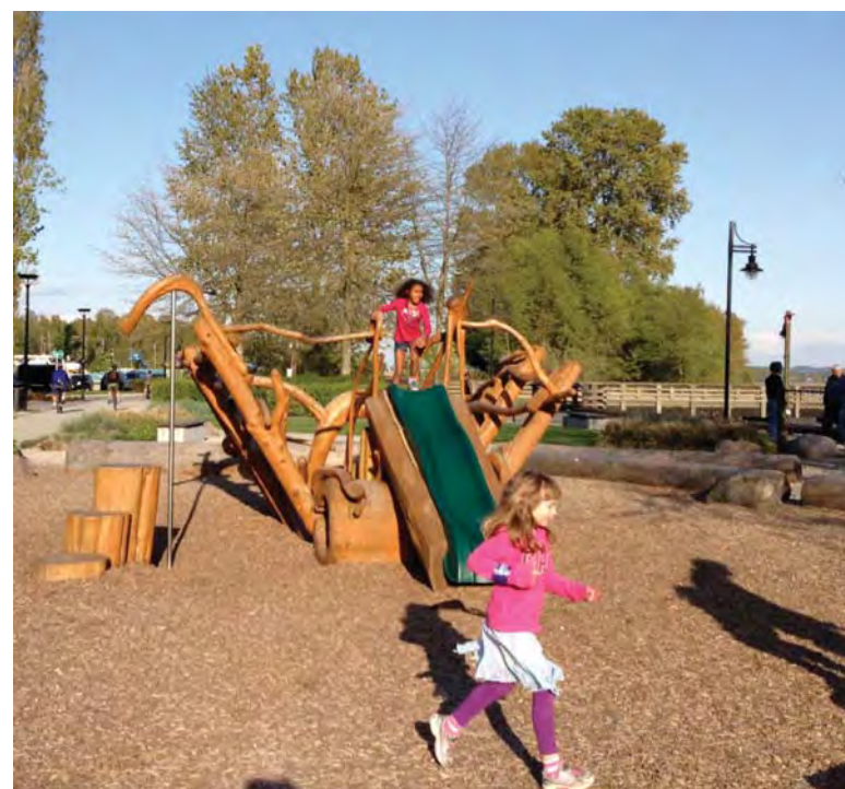
EXAMPLE OF RECYCLED WOOD PLAY STRUCTURE