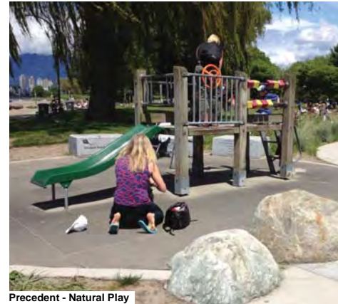
Precedent - Natural Play