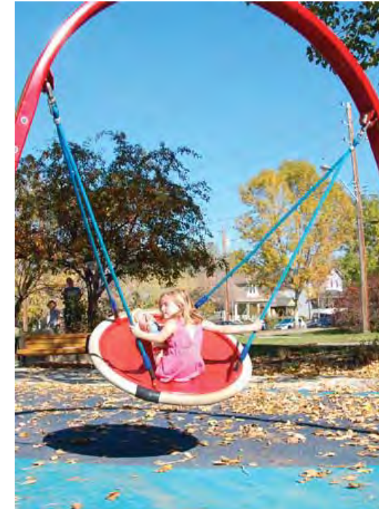
SWING OPTION: DISC SWING