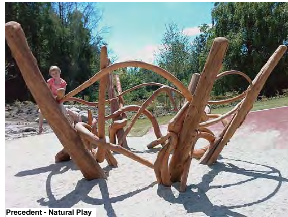
Precedent - Natural Play