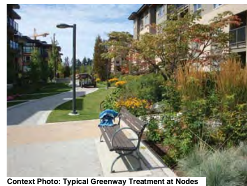
Context Photo: Typical Greenway Treatment at Nodes