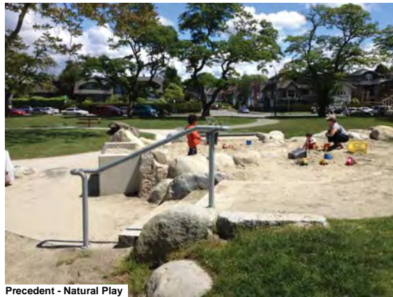
Precedent - Natural Play