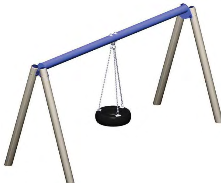
SWING OPTION: TIRE SWING