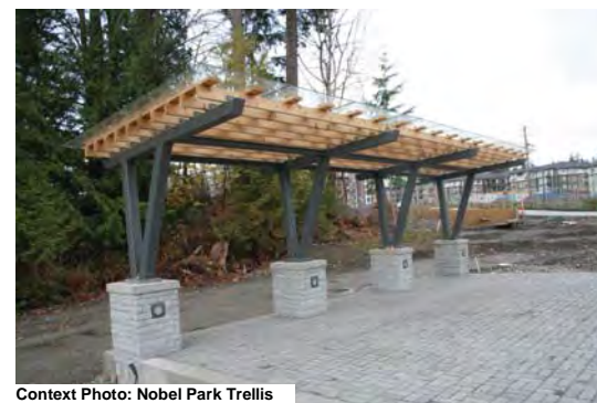
Context Photo: Nobel Park Trellis