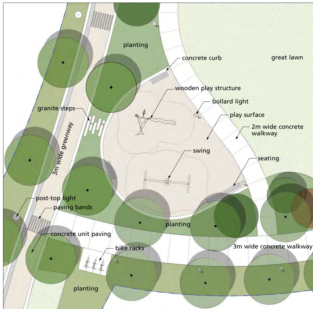
DETAIL PLAN: MUNDELL PARK PLAY AREA 1:100