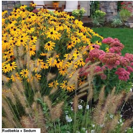
Rudbekia + Sedum