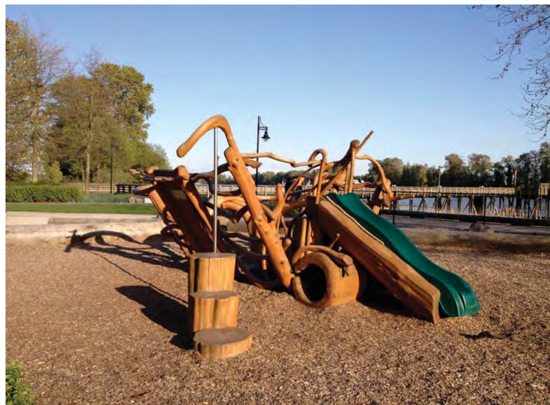
EXAMPLE OF RECYCLED WOOD PLAY STRUCTURE