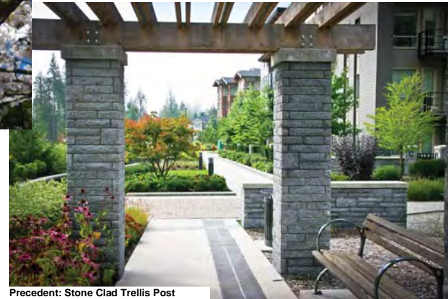
Precedent: Stone Clad Trellis Post