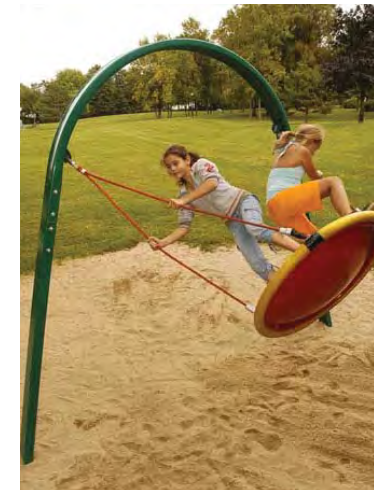
SWING OPTION: DISC SWING