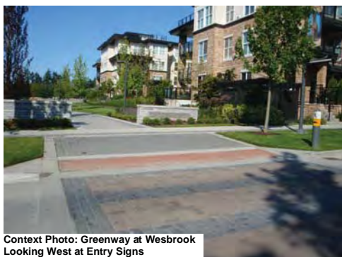
Context Photo: Greenway at Wesbrook Looking West at Entry Signs