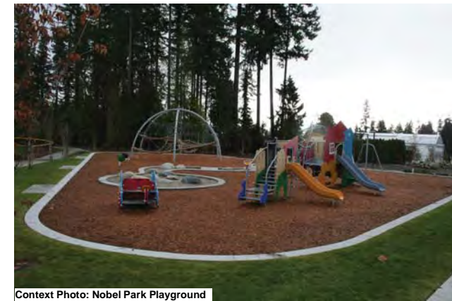
Context Photo: Nobel Park Playground