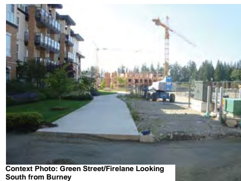
Context Photo: Green Street/Firelane Looking South from Burney