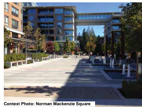
Context Photo: Norman Mackenzie Square