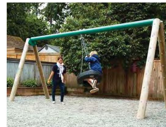
SWING OPTION: TIRE SWING