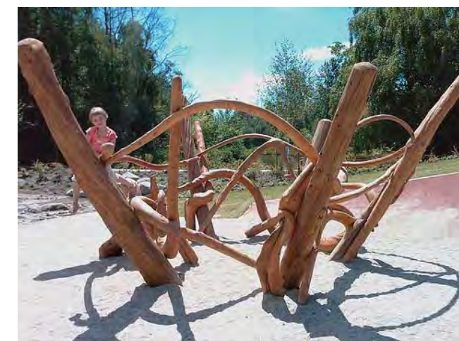
EXAMPLE OF RECYCLED WOOD PLAY STRUCTURE