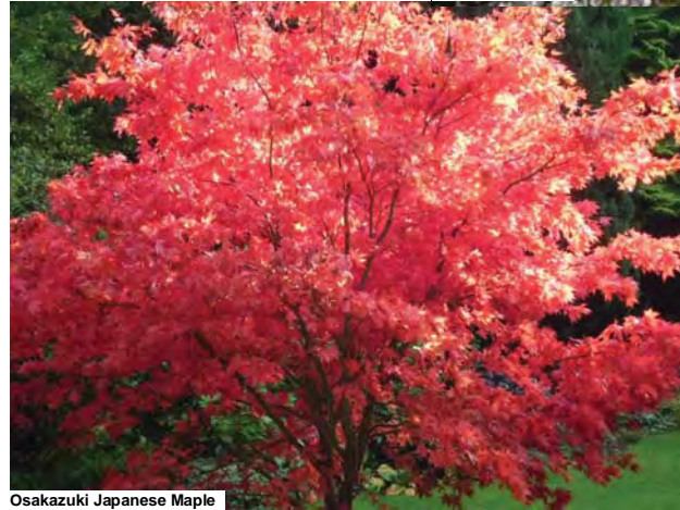
Osakazuki Japanese Maple