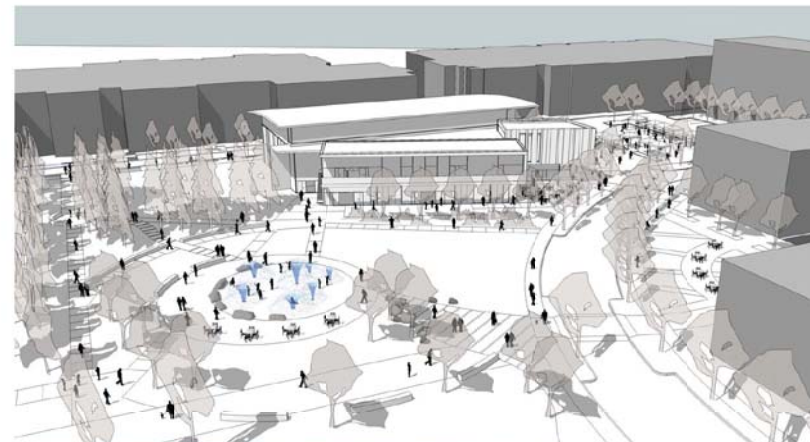
View of Community Centre from South