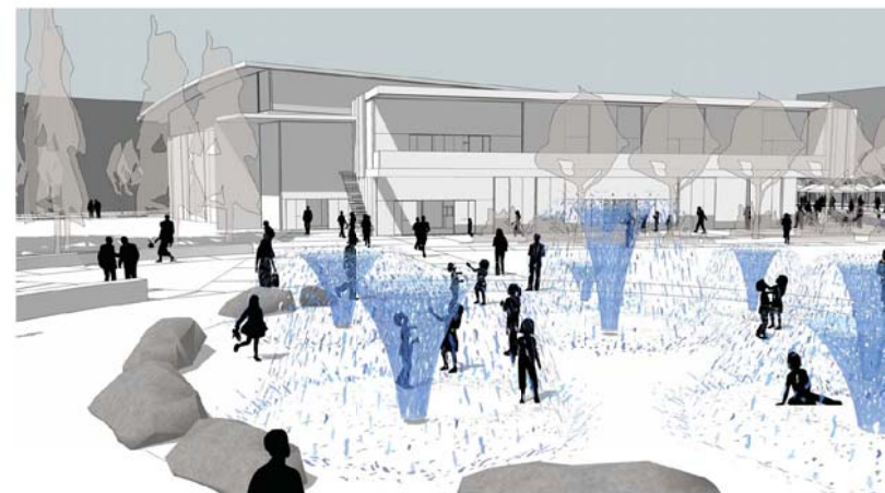
Close Up of Water Park