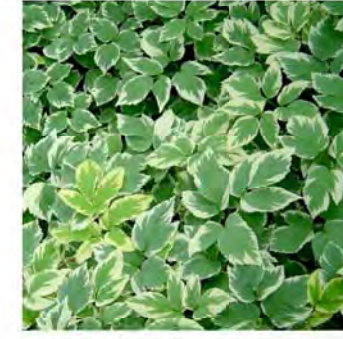
Cornus alba 'Elegantissima' - (Variegated Dogwood)