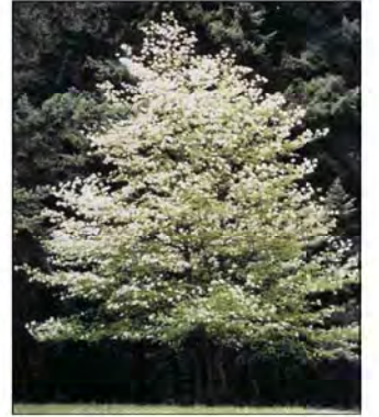
Cornus x nuttalli 'Eddie's White Wonder'