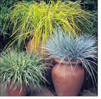
Various Grasses in Pots - Assists with slab/ planting depth conflicts