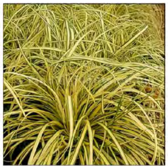
Carex - Green Sedge