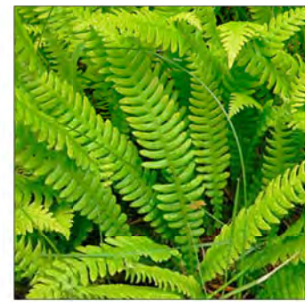
Blechnum spicant - (Deer Fern)