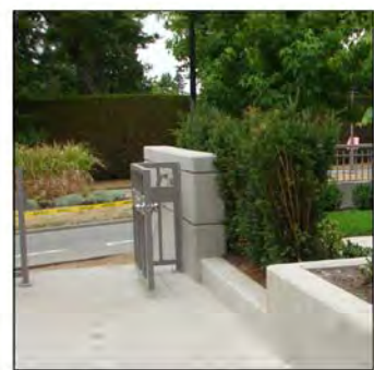
Concrete Wall at Walkout Patio Entry