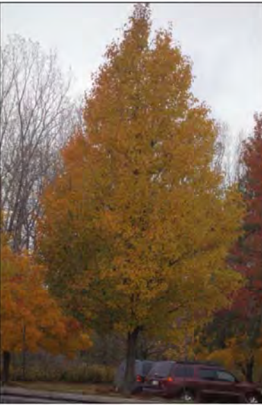
Pyrus calleryana 'Chanticleer'