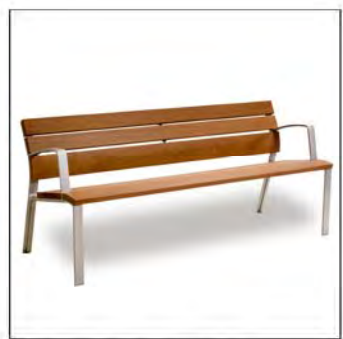
Steel and lpe Bench - Amenity Areas