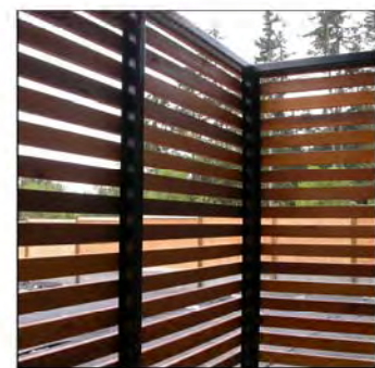
Privacy Screen - Wood Slats w/ Steel Posts