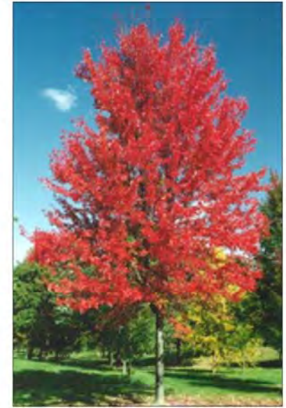
Acer rubrum 'Karpick'