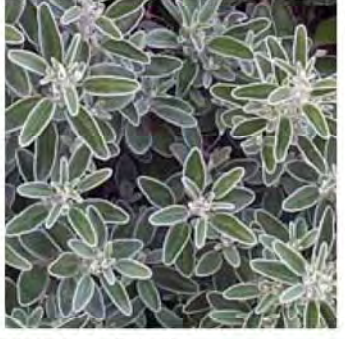
Senecio greyii (Senecio)