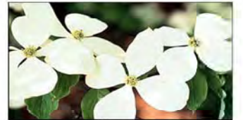
Cornus x nuttalli - Flower