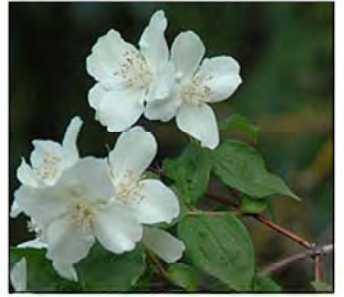
Pyrus calleryana 'Chanticleer' - Flowers