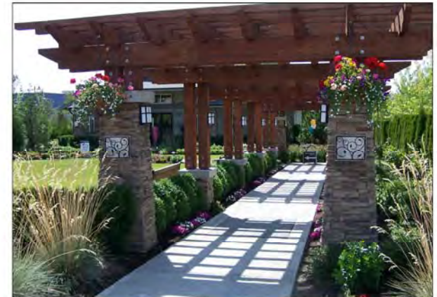
Wood Trellis- Courtyard Area