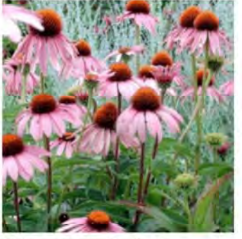
Echinacea purpurea (Coneflower) Flower - blooms June to August