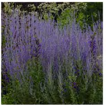
Perovskia atriplicifolia (Russian Sage) Flower - blooms July through fall