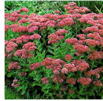
Sedum spectabile 'Autumn Joy' (Stonecrop) Flower - blooms later summer/early fall