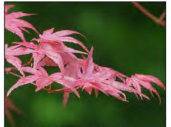
Acer Palmatum - Japanese Maple