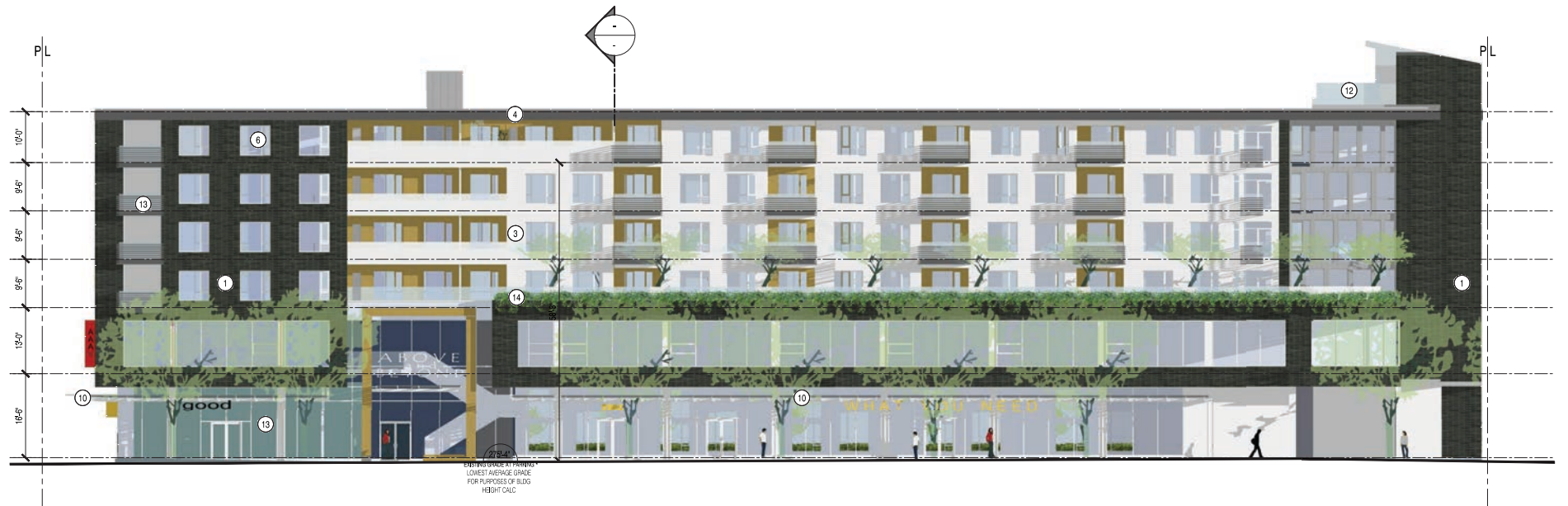
4 North Elevation SCALE: NTS