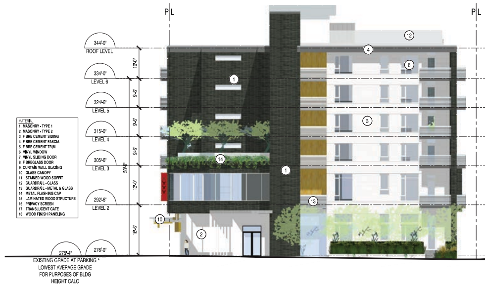
3 West Elevation SCALE: NTS