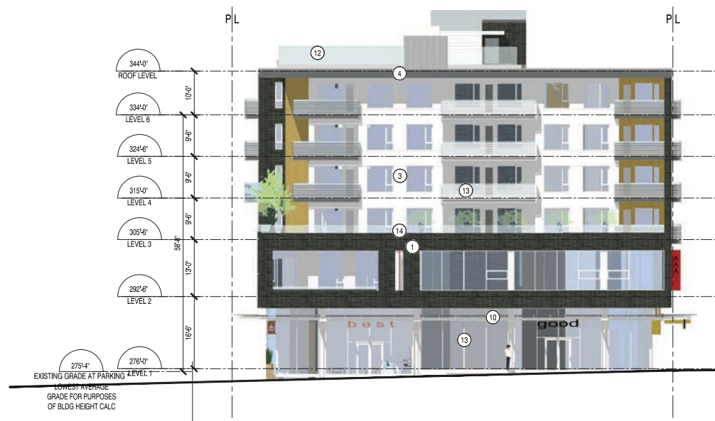
1 East Elevation SCALE: NTS