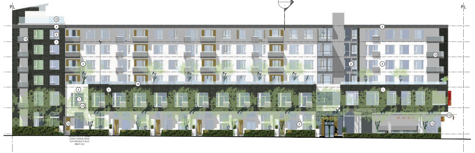
2 South Elevation SCALE: NTS