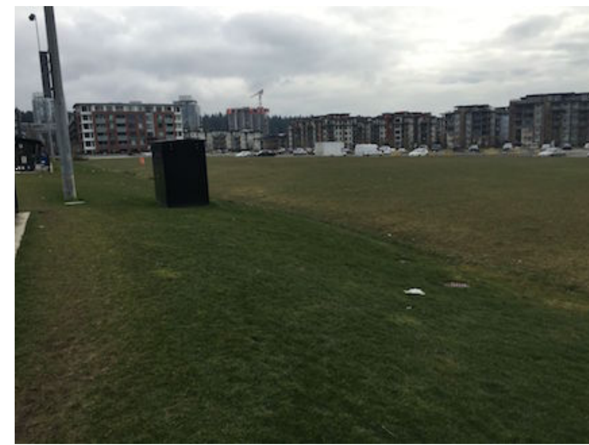
5. View South East across West End of Site