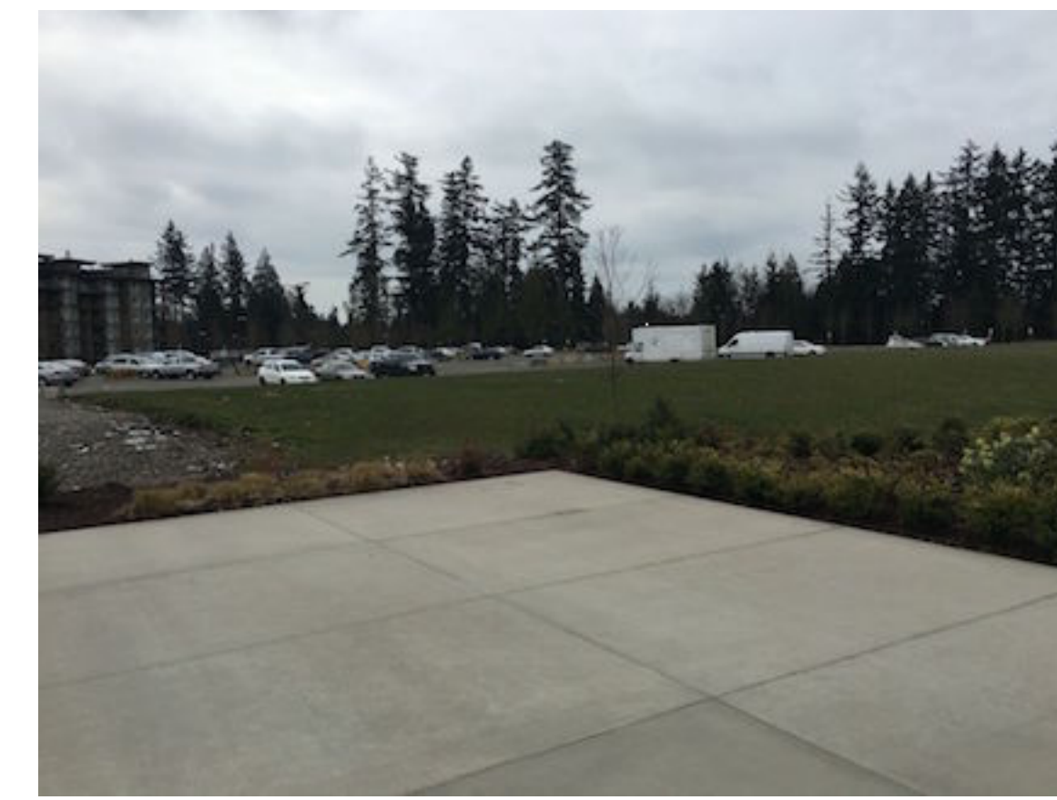
3. View South West Across East End of Site