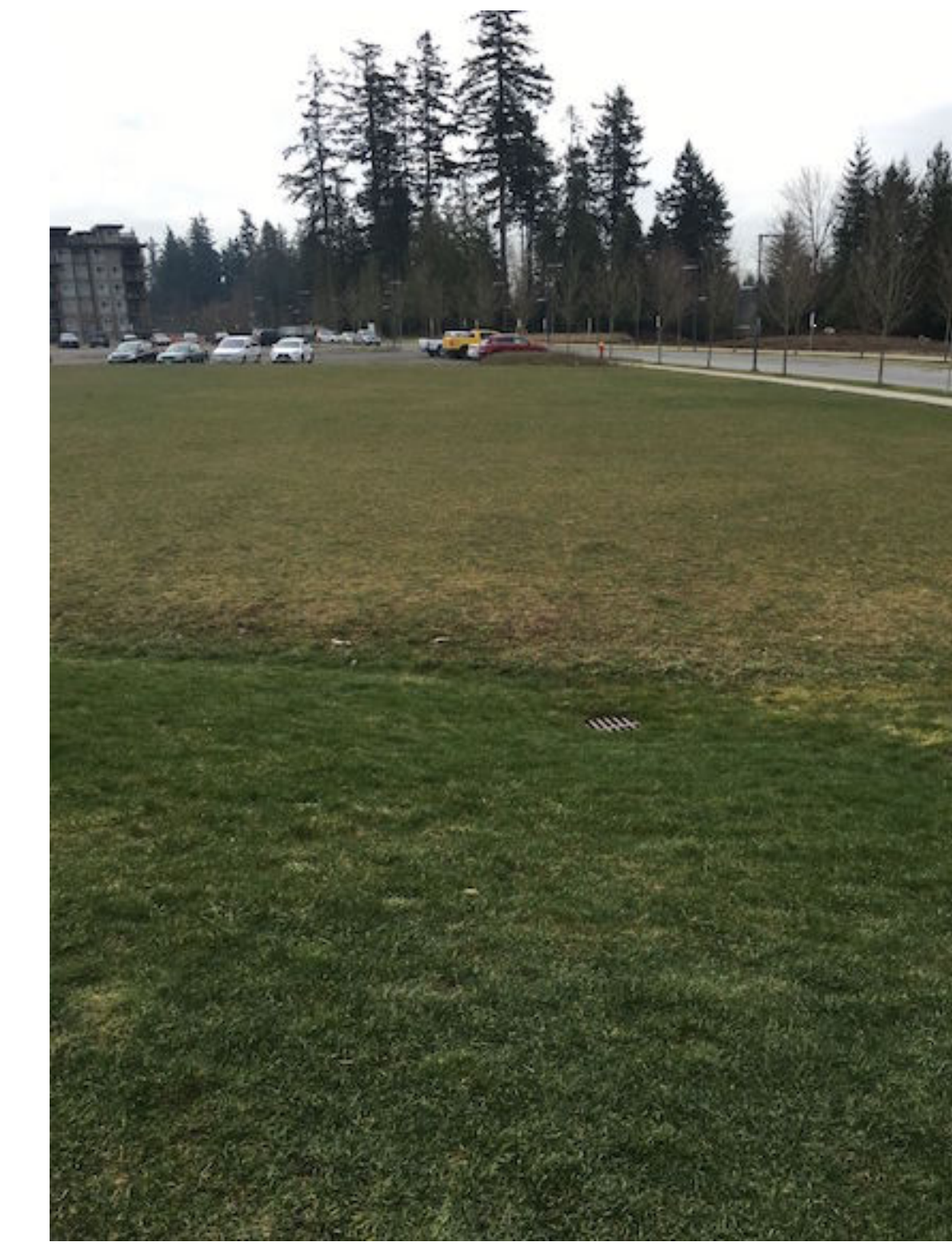
7. View South along West Edge of Site