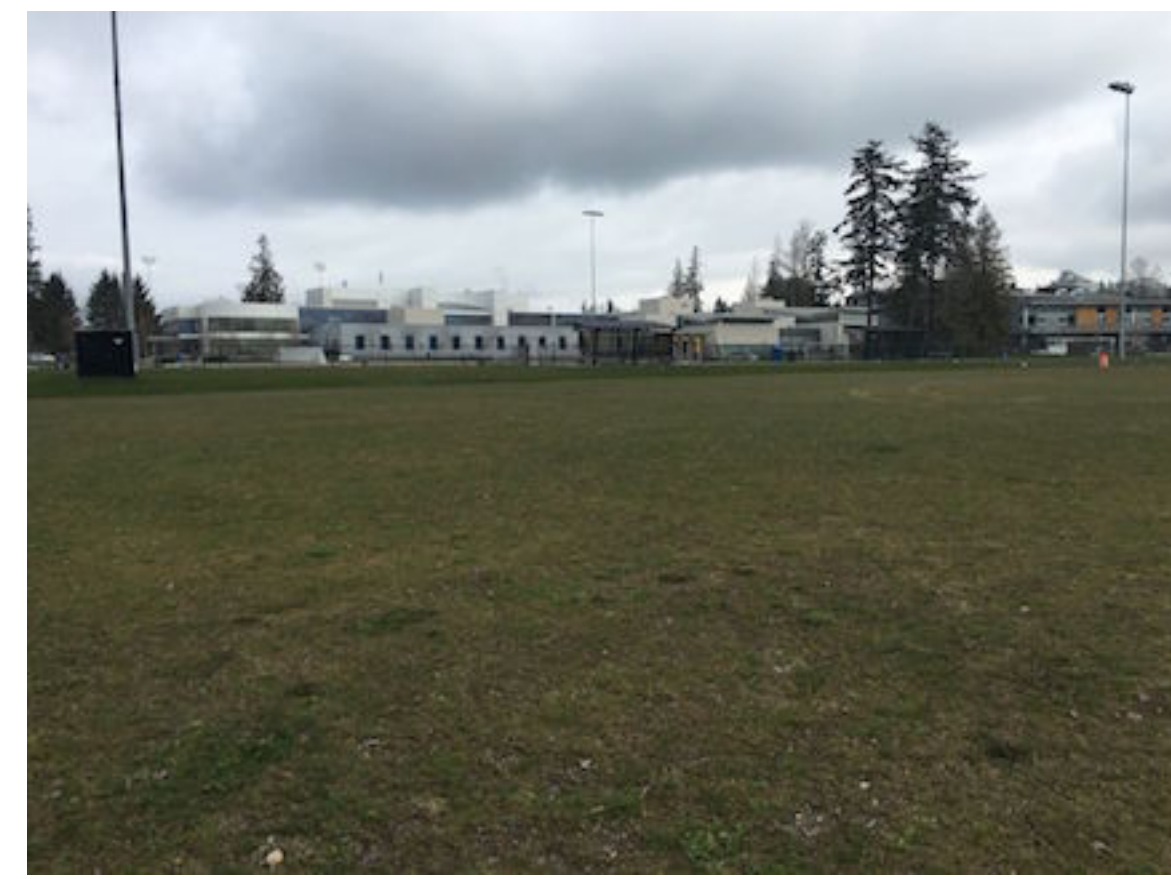
1. View North East towards Community Field