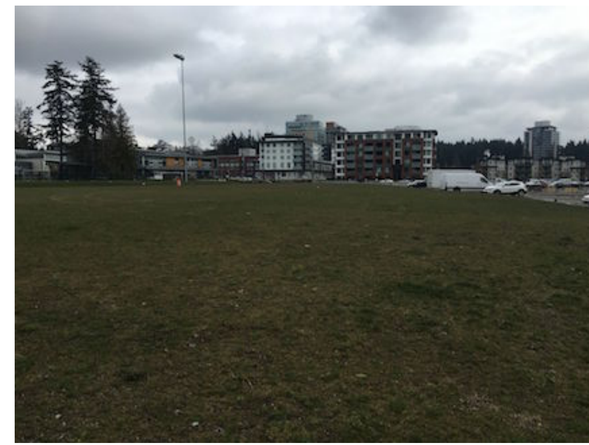
2. View East Across Site