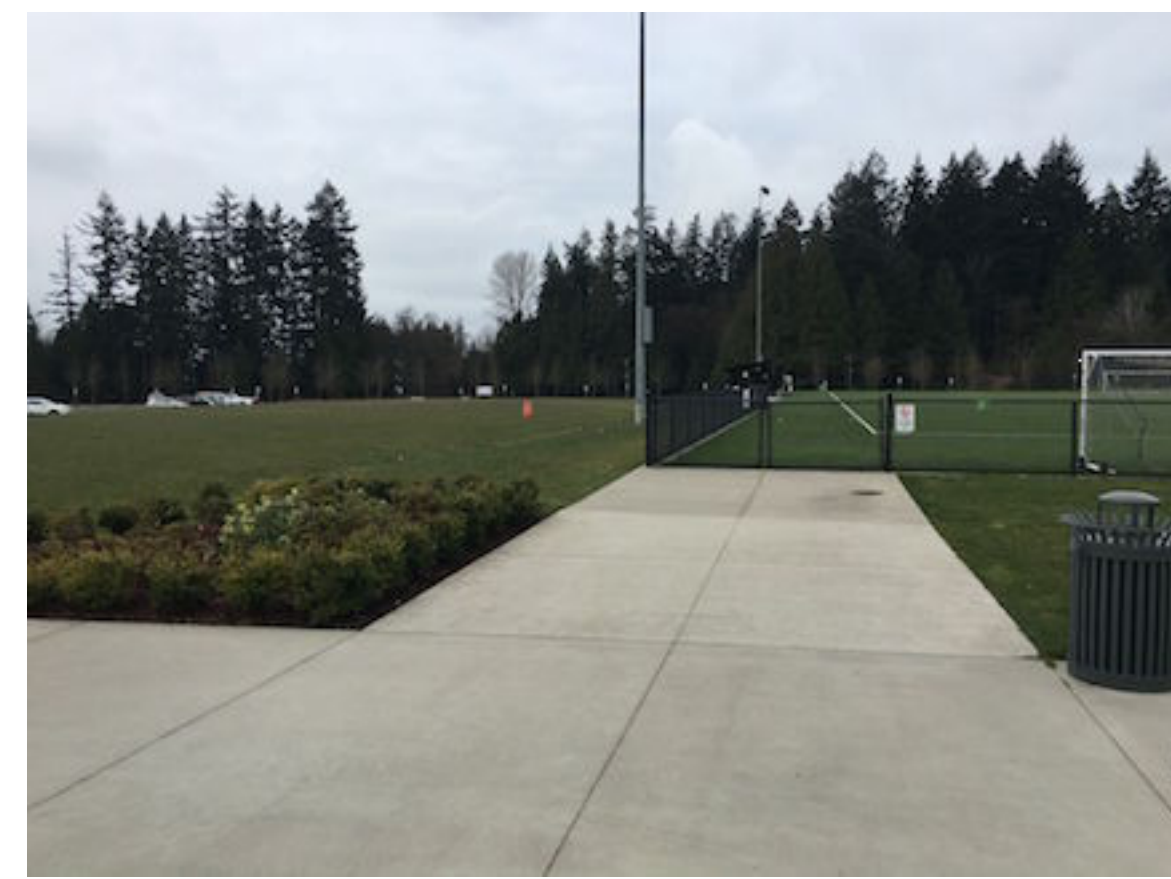
4. View West from Park onto Community Field