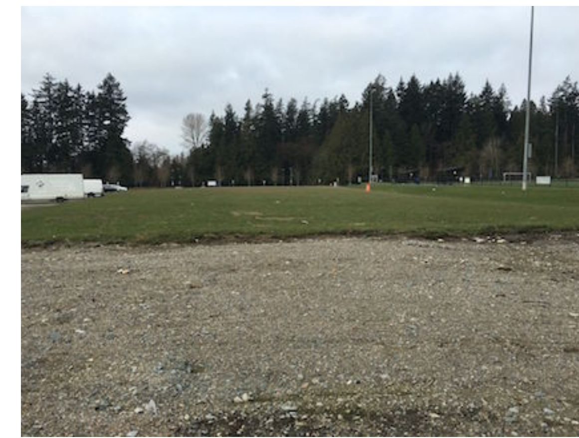
6. View West across Site