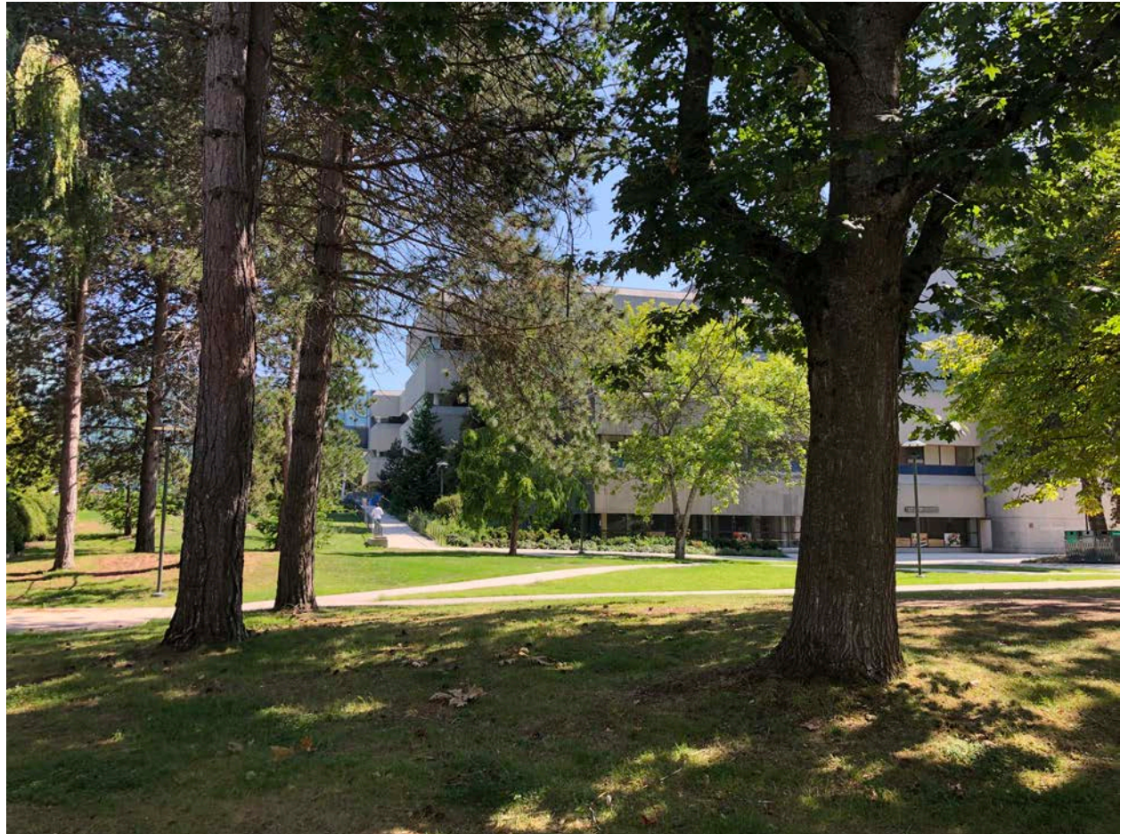
Location within stand of trees with view looking south toward the UBC Hospital Koerner Pavilion.

The proposed location for Stela I and Stela II is amongst a stand of mature trees in the green space on the east side of the Faculty of Dentistry. This location provides excellent site lines from multiple vantage points while at the same time, the sculptures' human scale, materiality, and relationship to the ground and surrounds allows for direct and unimpeded one-on-one encounters. With architecture of the same period in the background, the Friedman building (Thompson, Berwick & Pratt architects, 1961) offers a related design lexicon. Broadening these relationships between site and context, a neighbouring artwork installed on the south side of the MacDonal building is a ceramic wall mural, Untitled (1971) by Robert Weghsteen, that presents with its luminous silver-grey surface and abstract organic forms, a strong visual relationship to the Stelae.