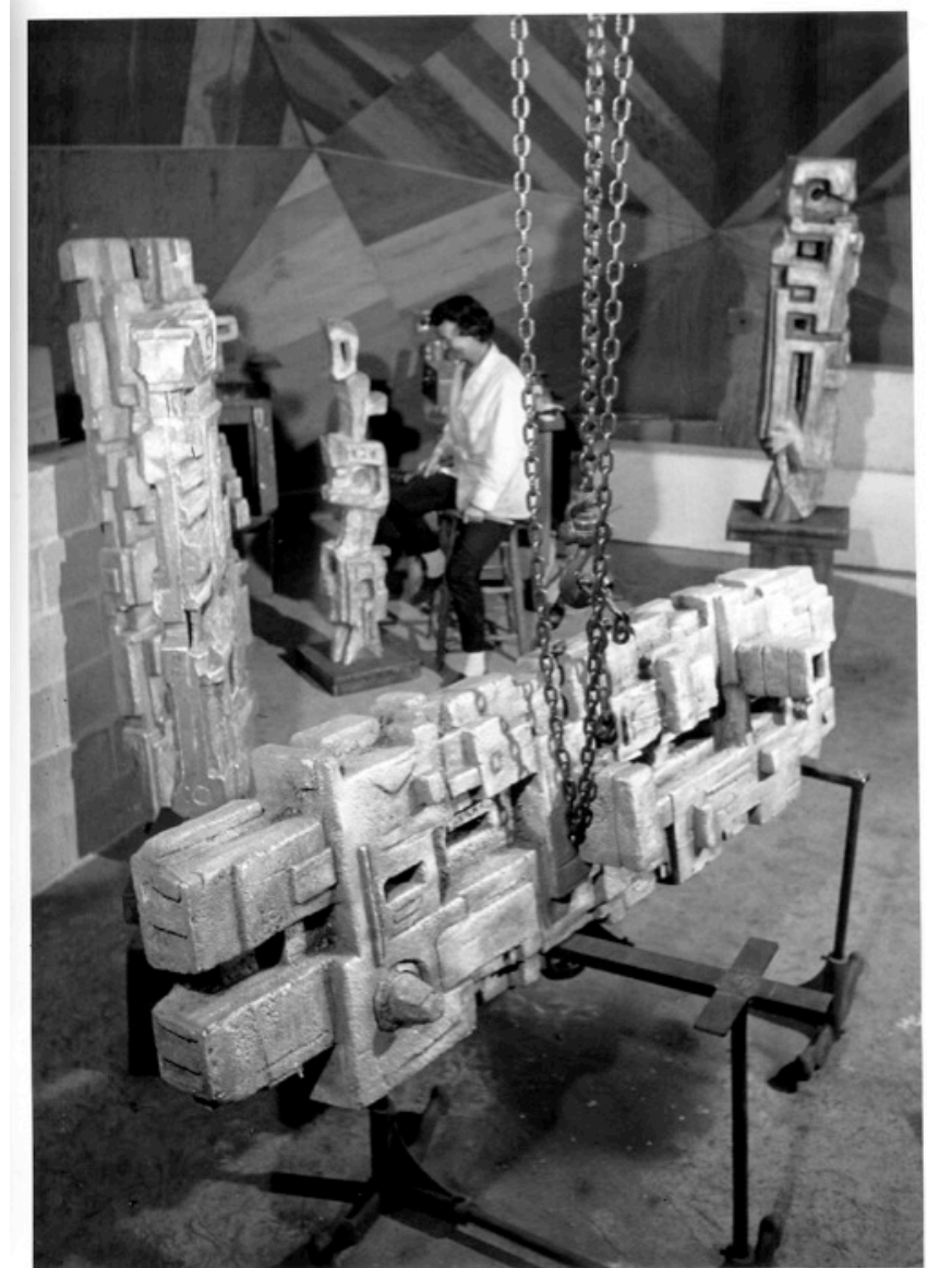
Stela I suspended by chains in preparation for transporting to Venice, 1964.

Stela II , 1963, aluminum, 183 x 51 x 26 cm