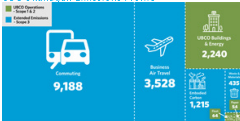
Figure 1b: Illustration from UBC Okanagan Campus emissions profile from the Climate Action Plan 2030 December 2021