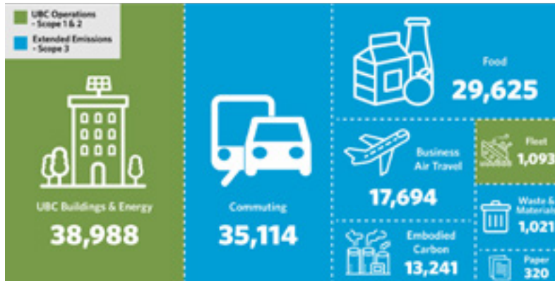
Figure 1a: Illustration from UBC Vancouver Campus emissions profile from the Climate Action Plan 2030 December 2021