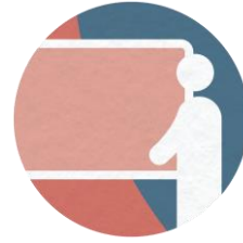
Speaker Event Sept. 21 in person