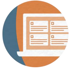
CV2050 Website: Info + Survey

See Appendix for more details on engagement approach and reach thus far.