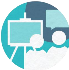
Open Houses Sept. 29, Oct. 12 in person (TBC)