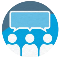
Roadshows (x25-30) + Community Conversations (x15-20)