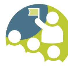
Walking tours (x3)