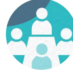
Workshops Sept.21, Oct.13 in person Oct. 3 online