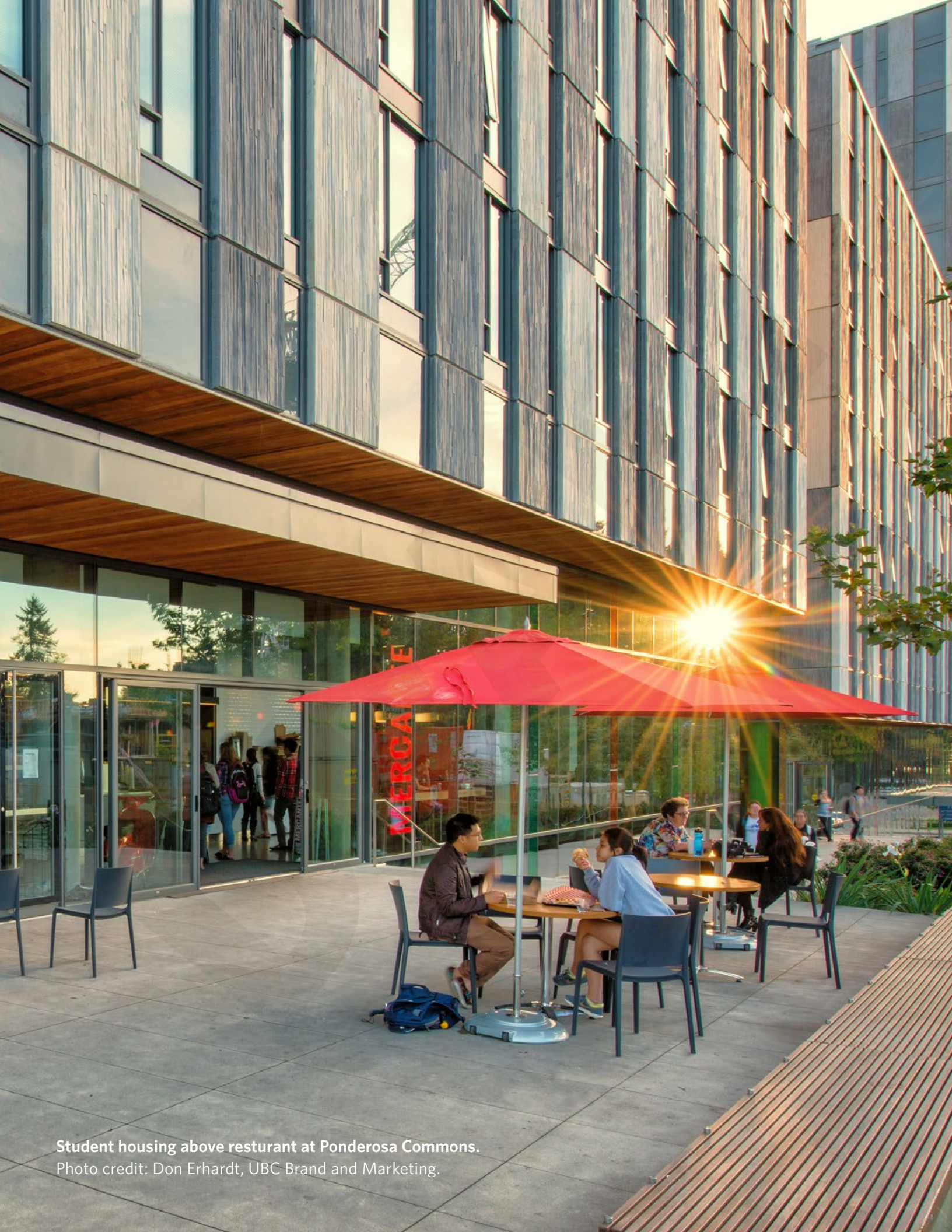
Student housing above resturant at Ponderosa Commons.