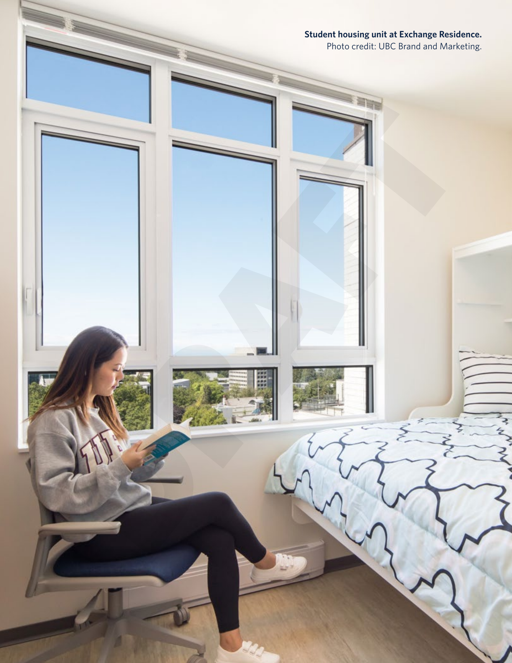
Student housing unit at Exchange Residence.