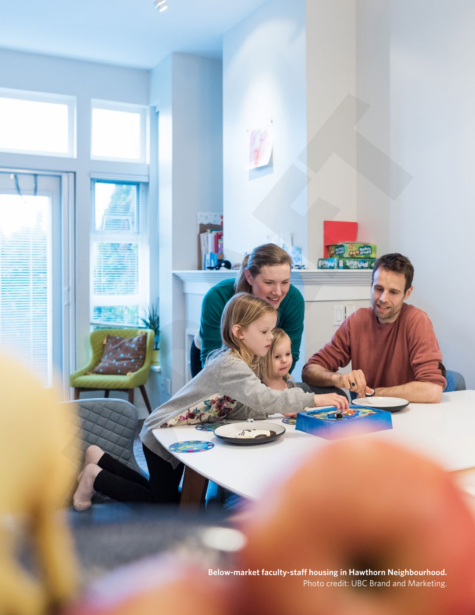
Below-market faculty-staff housing in Hawthorn Neighbourhood.