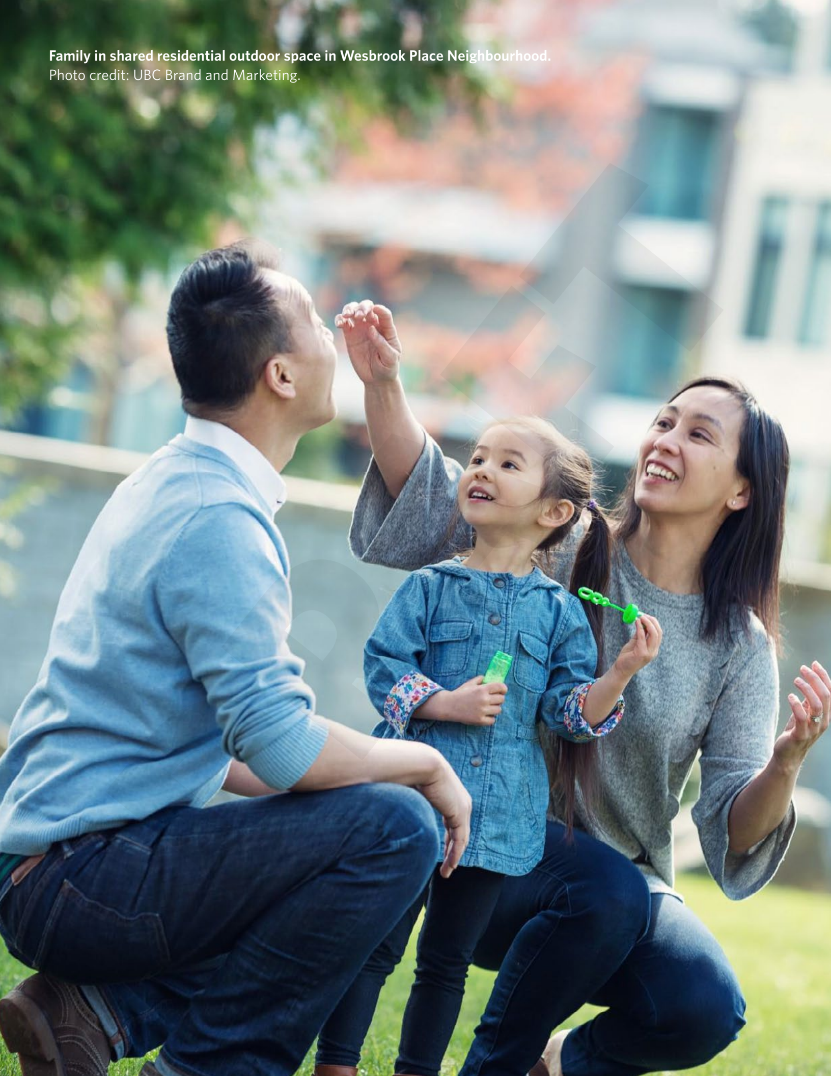
Family in shared residential outdoor space in Wesbrook Place Neighbourhood.