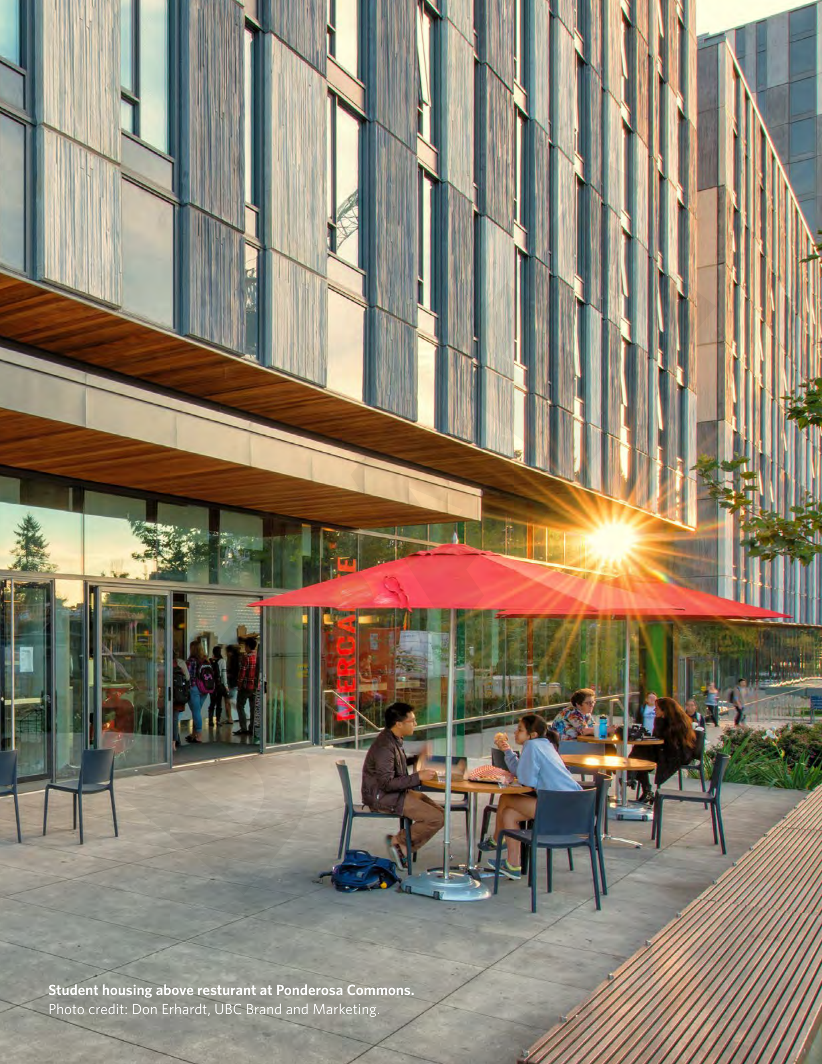
Student housing above resturant at Ponderosa Commons.